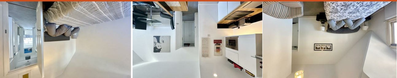
Flat 3 53 Wickham Avenue, Bexhill-On-Sea, TN39 3ES