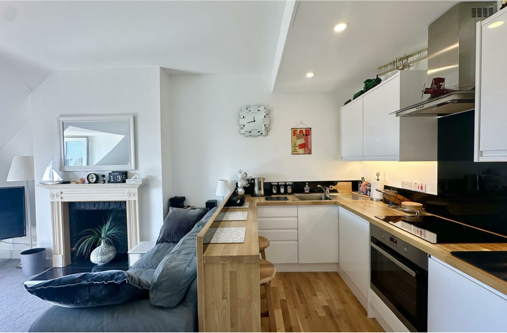
Flat 3 53 Wickham Avenue, Bexhill-On-Sea, TN39 3ES